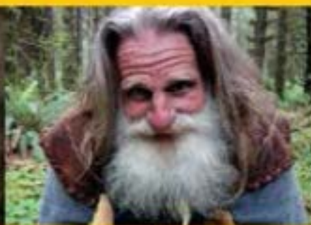
THE LEGEND OF MICK DODGE