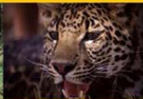
BIG CAT WEEK