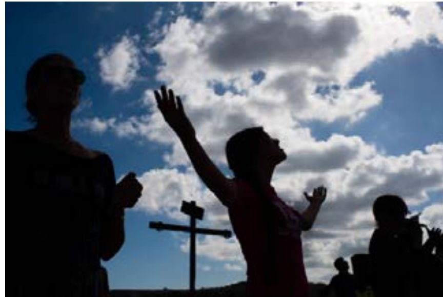
Members of Victory Outreach International worship on the Malecon on Easter.

between U.S. and Cuban officials that are leading to the restoration of diplomatic relations. At one point, the Vatican hosted meetings for U.S. and Cuban negotiators, and the pope’s blessing has provided President Obama with political cover as he faces opposition to the rapprochement with Castro from Cuban American lawmakers.