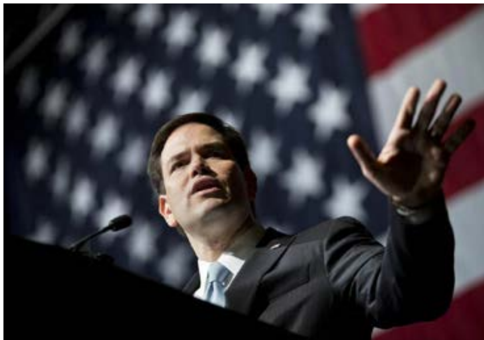
Republican presidential candidate Sen. Marco Rubio, R-Fla., speaks at the Georgia Republican Convention, Friday, May 15, 2015, in Athens, Ga.

Rubio's Vegas sojourn is more than a biographical quirk. It could also help the Florida senator in an early-voting state that is critical to his hopes of winning the Republican presidential nomination. As the son of casino workers who lived in a modest house in a blue-collar neighborhood, Rubio can speak in a personal way to the