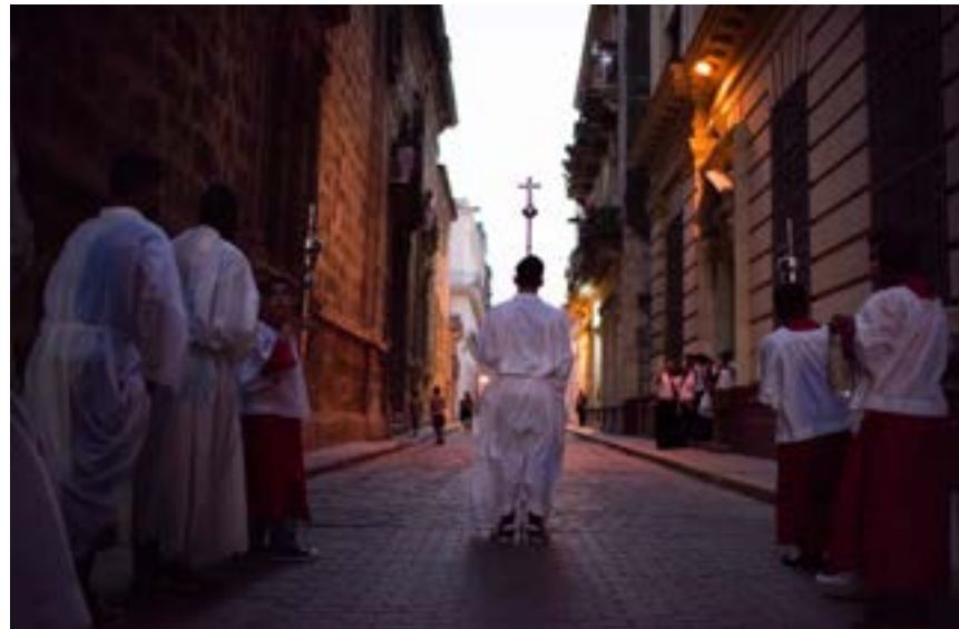
Thousands of Roman Catholics in Cuba marked the end of Holy Week by holding religious processions fully sanctioned by the government.

Like Catholic leaders, Cuba's evangelicals oppose abortion, which is legal in Cuba, as well as the highly publicized efforts of Mariela Castro, Raúl Castro's daughter, to win same-sex marriage rights and other protections for gay Cubans. The Pentecostal group says it goes out on weekend nights to