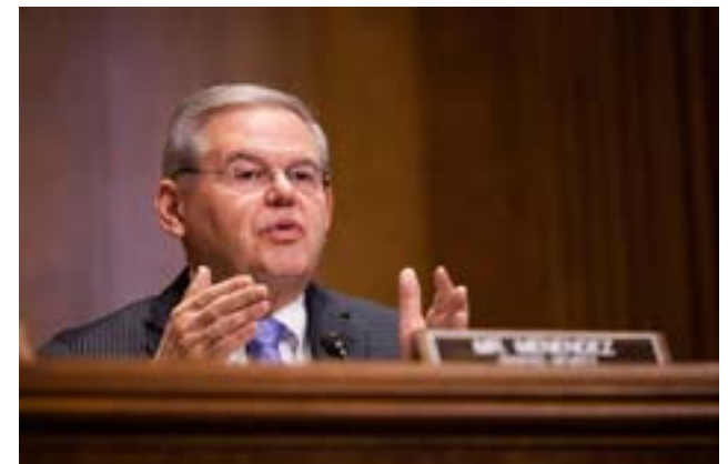
In an effort to expand diversity, U.S. Sen. Robert Menendez, D-N.J., released his report about corporate America’s diversity.

Menendez revealed there have been more diversity efforts among the participating companies during 2014 than 2013. He highlighted Intel Corporation’s $300 million fund to improve its diversity efforts and gain women and minorities within the technology sector.