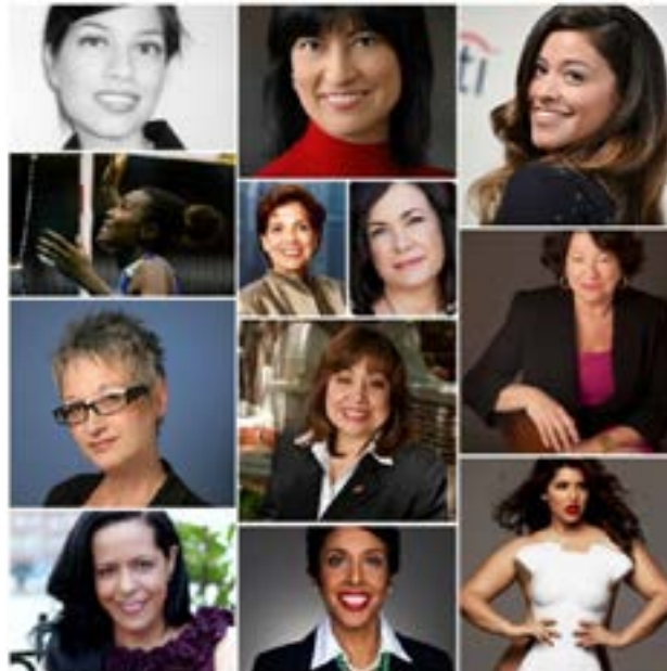
These powerful women are Latinas who've penetrated industries and markets, and offered unique talents and perspectives, all while simultaneously making enormous gains for themselves and setting the stage for the multi-generational success of Latinas. They are power-wielding bombshells and champions of Latina sisterhood.

The top industries for women are health care and social assistance; professional, scientific and technical services; administrative and support and waste management; remediation services and retail trade. A considerable amount of entrepreneurial growth across industries can be attributed to multicultural business growth.