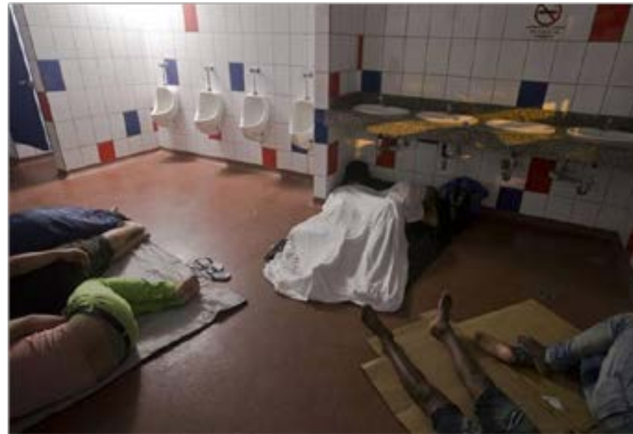
Cuban migrants sleep inside a public restroom of the border control building, in Penas Blancas, Costa Rica, border with Nicaragua. Central America governments have called an emergency meeting on recent Cuban migrant crisis in El Salvador on Tuesday. Nicaragua, a close socialist ally of Cuba, has not publicly responded to a Costa Rican proposal to create a "humanitarian corridor" for Cubans to move unhindered toward the U.S.