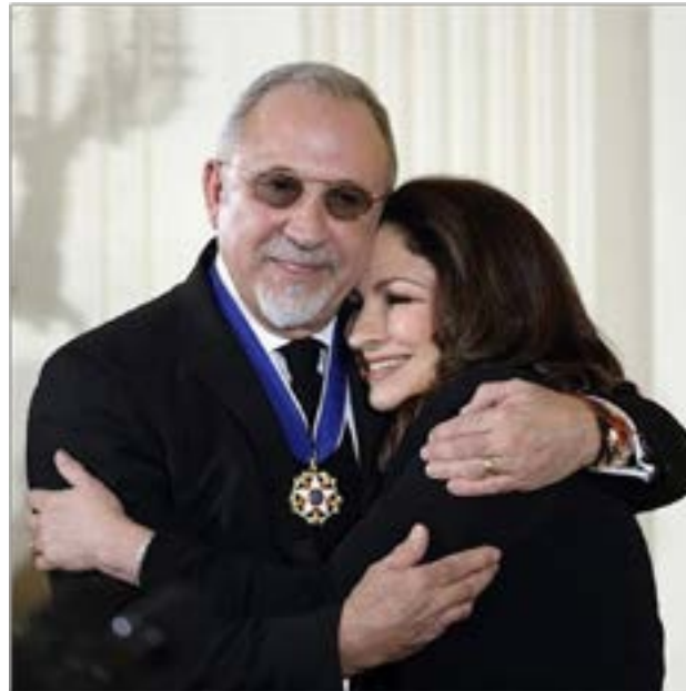
Singer Gloria Estefan and husband, music producer Emilio Estefan, warmly hug following the Presidential Medal of Freedom ceremony in the East Room of the White House.